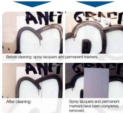
A4 sample Reynobond®|Reynolux® A4 sample Reynobond®|Reynolux® with Anti-Graffiti coating

The main feature of the special Anti-Graffiti coating prevents graffiti to be fixed on the panel surface. Its high-resistance makes it more difficult for graffiti artists to leave their tags or paintings directly on facades or walls. Spray lacquers virtually pearl off the surface, which makes it cleaning easier. The Anti-Graffiti coating also contributes to quickly and easily remove acts of vandalism that can damage a building's and company's image and reputation without referring to any particular cleaning guideline. High-pressure cleaners and scrapers make multiple cleanings and the removal of air-drying spray lacquers, permanent markers, adhesive labels and posters possible.